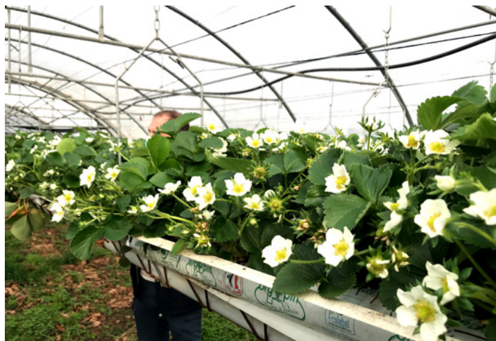
MARVELLA - Hydroponic. glass